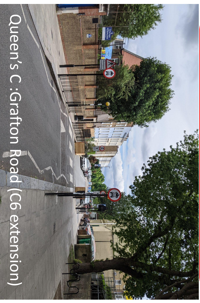
Queen's C :Grafton Road (C6 extension)