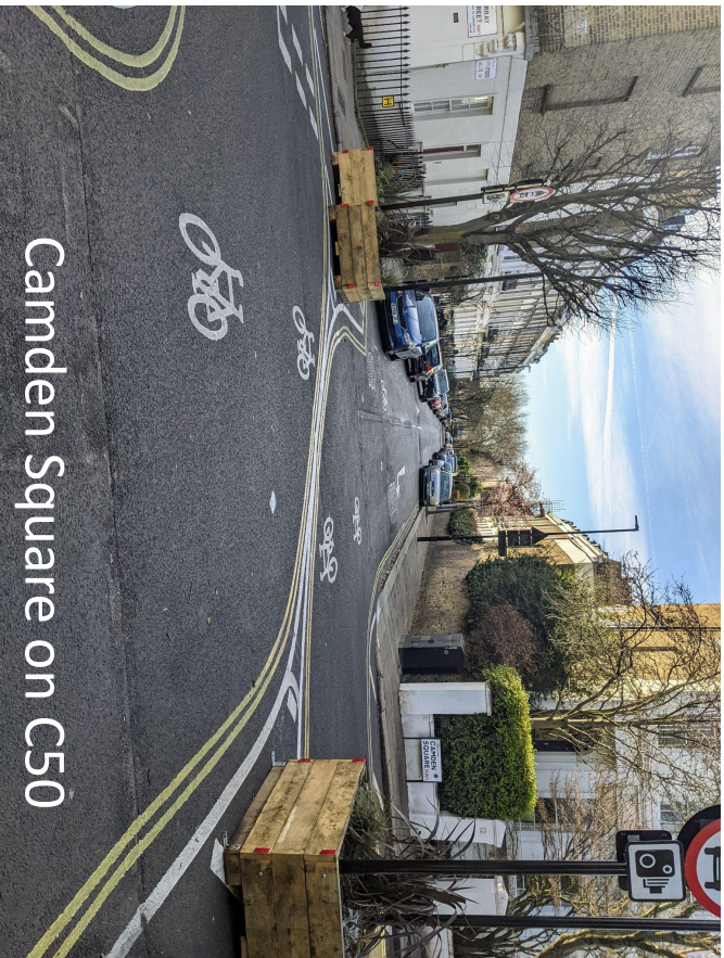
Camden Square on C50