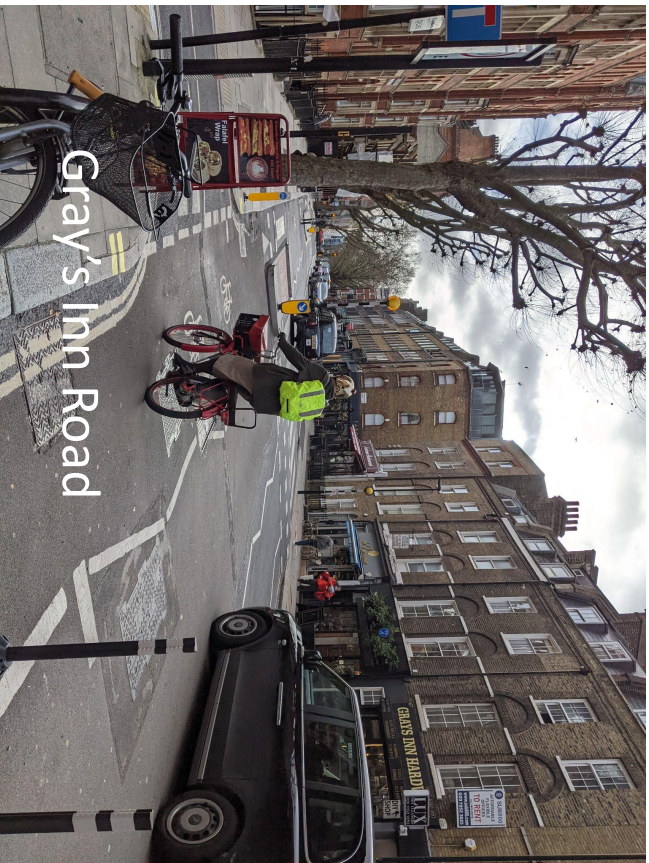
Gray's Inn Road

Prince of Wales Road, Chalk Farm Road, York Way and St Pancras Way