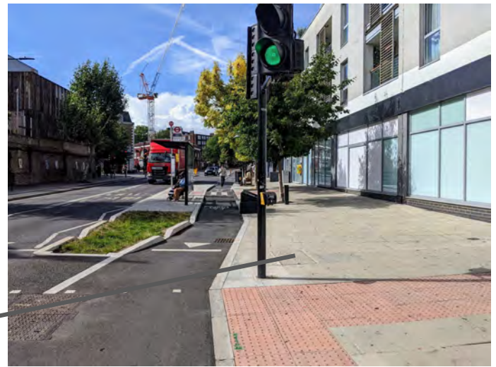
Chalk Farm Road