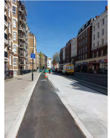
Clerkenwell Rd at Laystall St