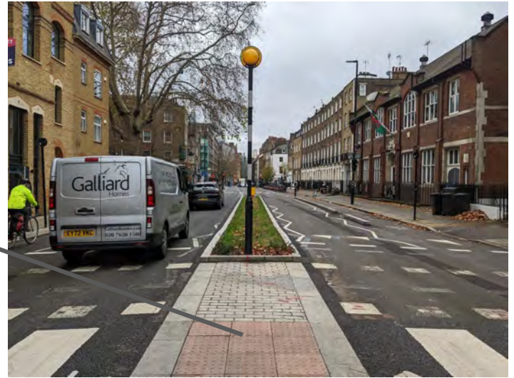
Gray's Inn Road