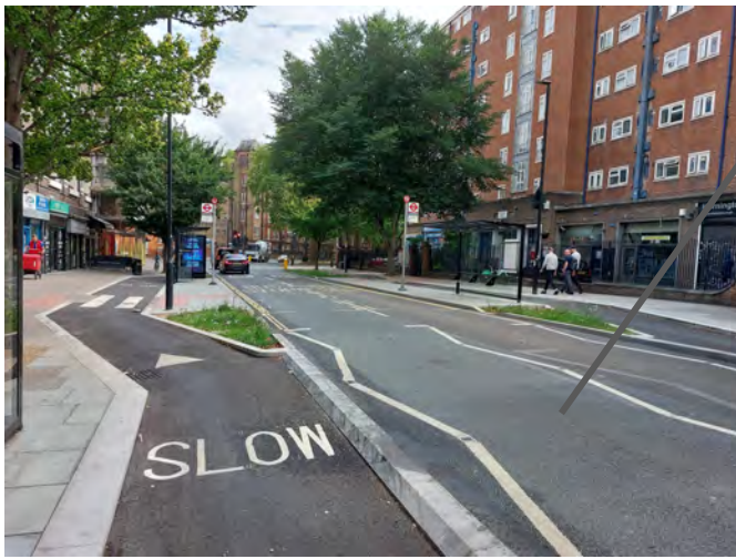
New: Crowndale Road